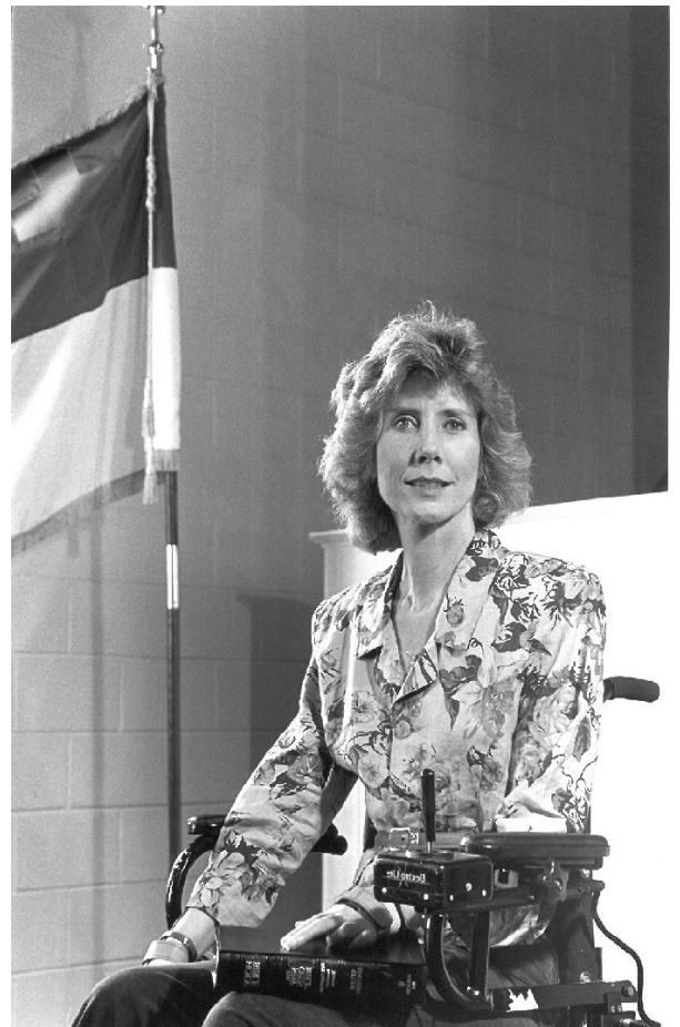
Founder of Joni and Friends Ministries, Joni Eareckson Tada, in electric wheelchair