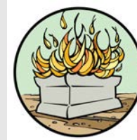
Elijah and Baal 1 Kings 18