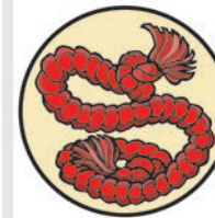
Rahab Josh. 2: 1-21