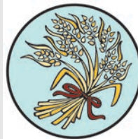
Ruth and Boaz Ruth 2-4