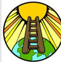
Jacob's Dream Gen. 28: 10-22