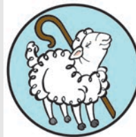
David Chosen 1 Sam 16: 1-15