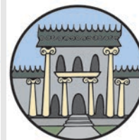
God's Temple 1 Kings 5-6