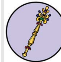
Esther's People Esther 4