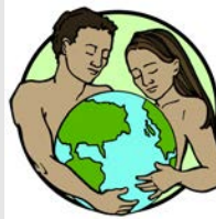
Story of Creation Gen. 1:26-31