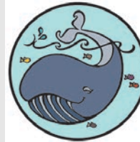
Jonah and the Fish Jonah 3: 1-5