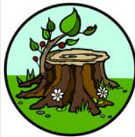
The Jesse Tree Is. 11: 1-2

The Jesse Tree A Jesse Tree is a way of preparing for Advent by journeying through the stories on Jesus's family tree. Each day of Advent, read a Bible story about someone on Jesus's family tree and hang an ornament symbolizing the story on your Jesse Tree. As you decorate your tree, you'll see how God prepared for Jesus to be born through many generations.