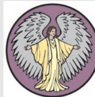
Angel Appears to Joseph Matthew 1: 18-25