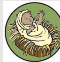
Jesus is Born Luke 2: 6-21