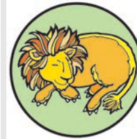
Prophecy of Bethlehem Micah 5: 1-5