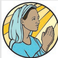
Mary Chosen Luke 1: 26-38