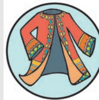
Joseph Gen. 37: 1-36