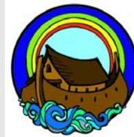
Noah's Ark Gen. 6