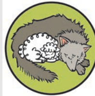
Prophecy of Second Coming Is. 11: 6-9