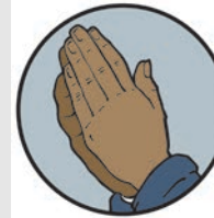
Elizabeth and Zechariah Luke 1: 5-25