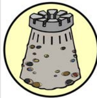
The Watch Tower Hab 2: 1-4