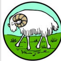
Sacrifice Gen. 22: 1-14