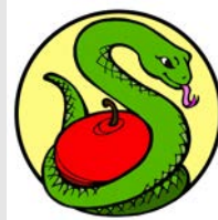
The Fall Gen. 3