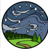
Abraham Gen. 15: 1-6