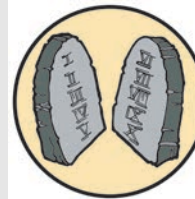
10 Commandments Dt. 5: 1-22