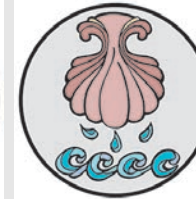
John the Baptist Matthew 3: 1-6