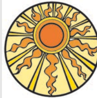
Prophecy of Savior Is. 9: 2-7