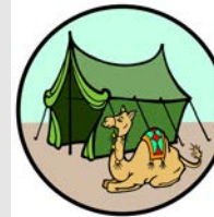
Promised Land Gen. 12: 1-7