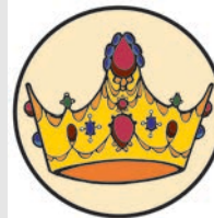
David Crowned 2 Sam 5: 1-5