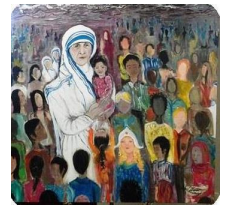
St. Teresa of Calcutta Pray for Us!