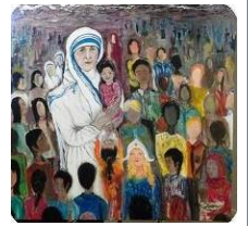
St. Teresa of Calcutta Pray for Us!