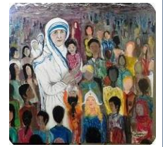
St. Teresa of Calcutta Pray for Us!