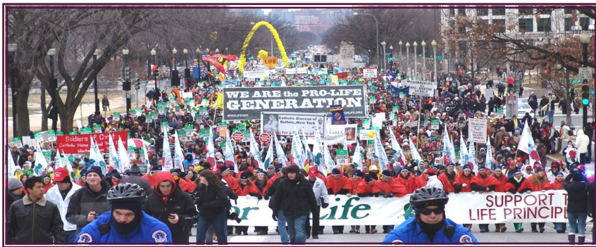
St. Francis HS leading the March 2013